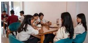
STUDENT FRIENDLY ENVIRONMENT